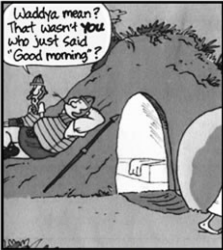
from JoyfulNoiseletter.com ©Cuyler Black Reprinted with permission