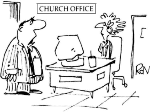
"If telemarketers call, invite them to church."